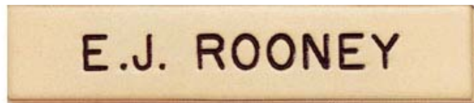
J2 - 3" x 5/8"