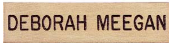
J3 - 2 1/2" x 5/8"